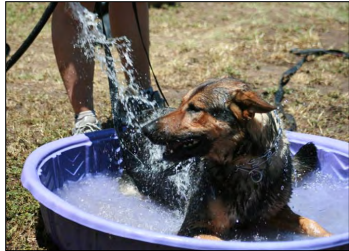
Above: Ferox v Tehillah takes a dip in the kiddie pool after a session on the training field.

As the day marched on, handlers and spectators alike spent time catching up with old friends, making new acquaintances, watching the training from the covered bleachers or sun-shade on the field, browsing the merchandise of different vendors at the event, or trying their luck with the raffle and silent auction. Dogs entering or exiting the field after a successful training session were able to enjoy a cooling dip in one of the plastic wading pools—known as the „Doggie Spa’—with some dogs taking to the water more eagerly than others. Young dogs and their people socialized throughout the grounds, taking in the action and acclimating to the new sights and sounds. It was a rare person indeed who could resist the urge to befriend the cute little puppies!