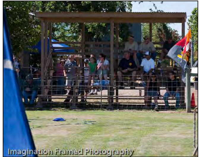
Spectators enjoyed the new bleachers at the PCSC field.

The early morning sun rose quickly into the sky, bathing the stadium-sized grass field and brand-new bleachers in its warm glow. It was guaranteed to be a warm day, but a stiff breeze picked up and kept the temperature in the low 90s, creating only a few minor problems of its own when anything not nailed down inevitably tried to become airborne. Check-in and registration began at 7 a.m. and continued unabated throughout the day as more handlers and spectators rolled in for the event. Helpers were quickly listed on the whiteboard, and handlers were able to choose the helper they wished to work with that day. There were many excellent helpers to select from: Joel Monroe, Dave Deleissegues, Gary Park, Shane Garrehy, Mario Fernandez, Martin Vollrath, and Zoltan „Zoli” Nagy, Lauron Williams, and John Riboni. Up-and-coming helpers Tim Cutter and Tyler Pluss also assisted in working various dogs over the course of the day.