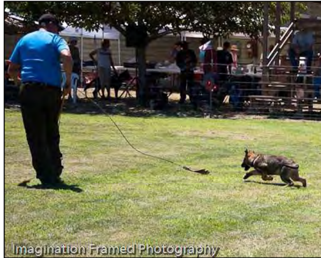
Imagination Framed Photography