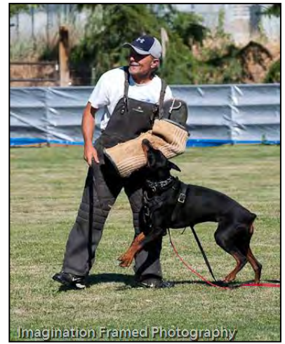
Imagination Framed Photography